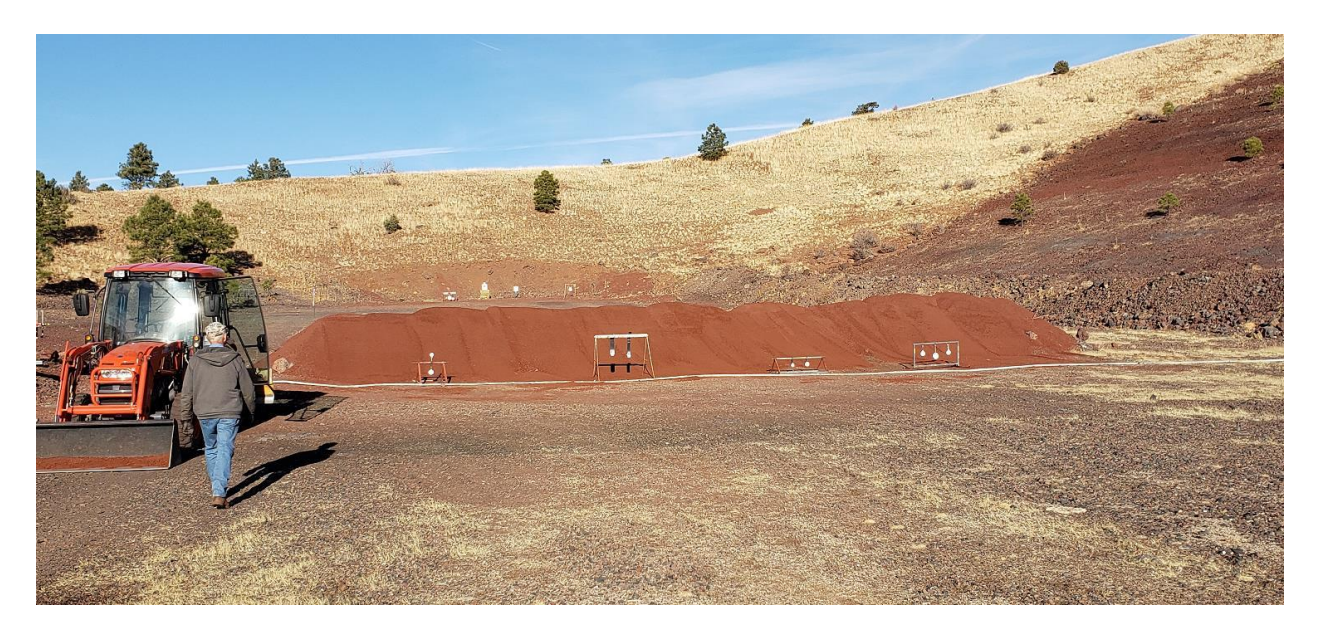
The 100 yard Rifle berm work completed. Thank you Keith!