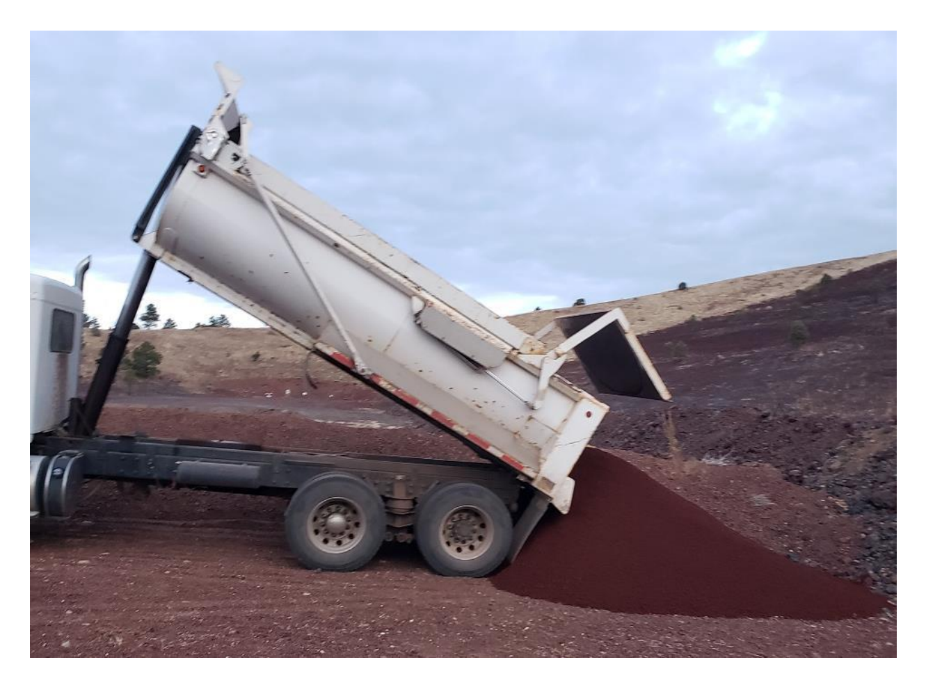
The first of four loads – totaling approximately 50 cubic yards of fine cinder material.

The load above was for the 25 yard Pistol impact berm.