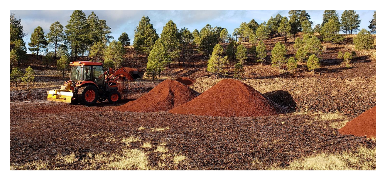
The next three loads went to the 100 yard Range impact berm.

The load above was for the 25 yard Pistol impact berm.