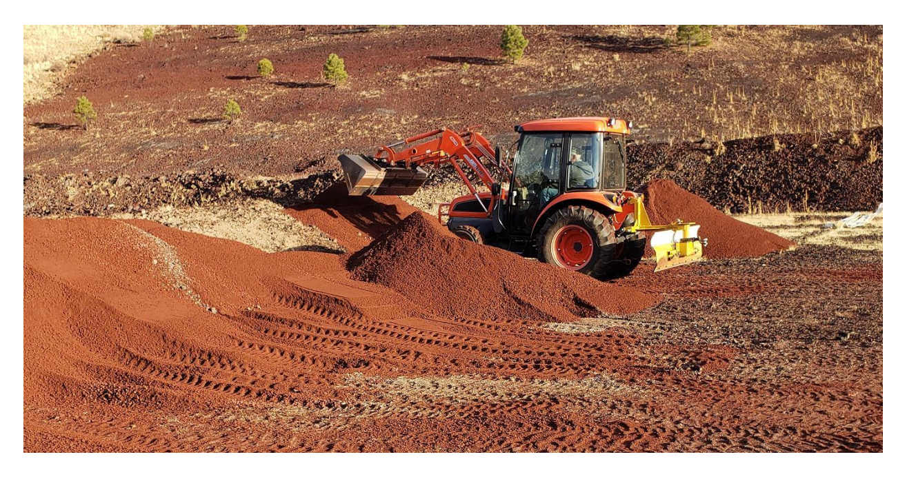
Material then being spread evenly over the face of the berms.