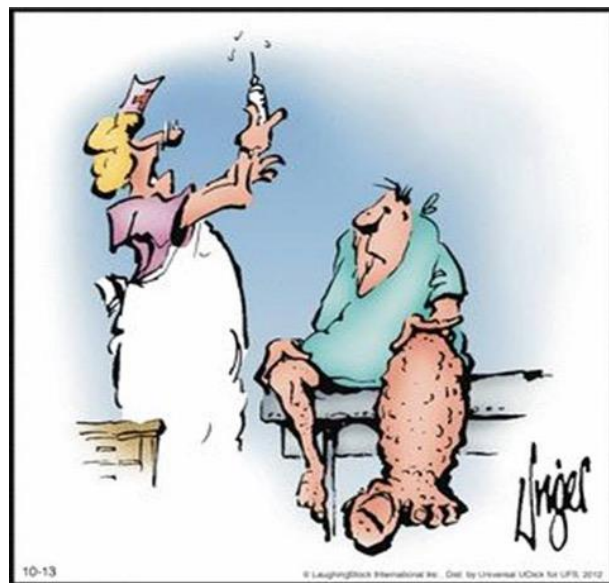
“Which leg is it?”