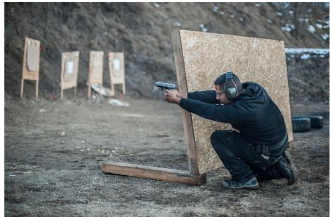
Practical Pistol Steel challenge and Tactical Pistol Shooting