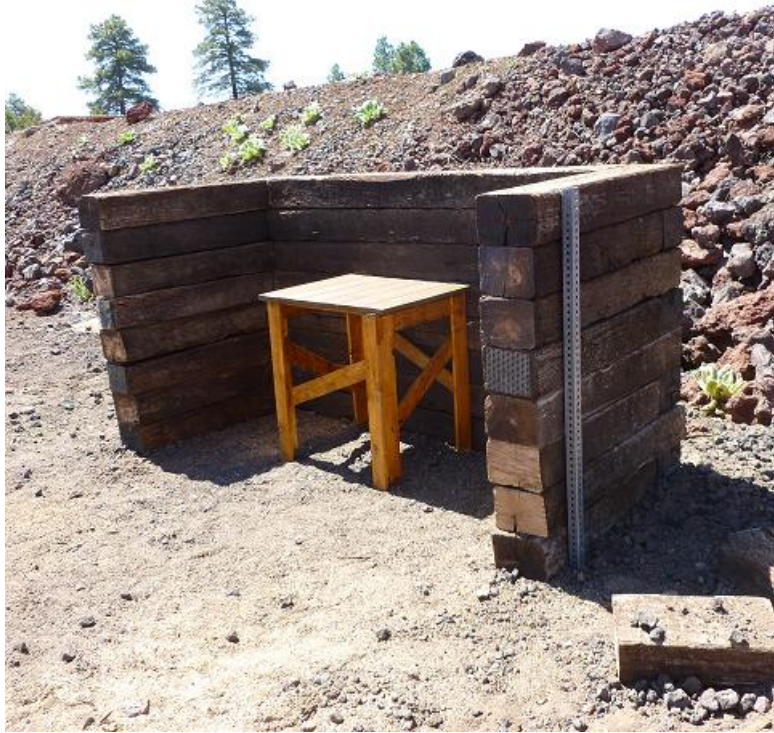
New Range "Weapon Safety Box" located at North Pistol bay