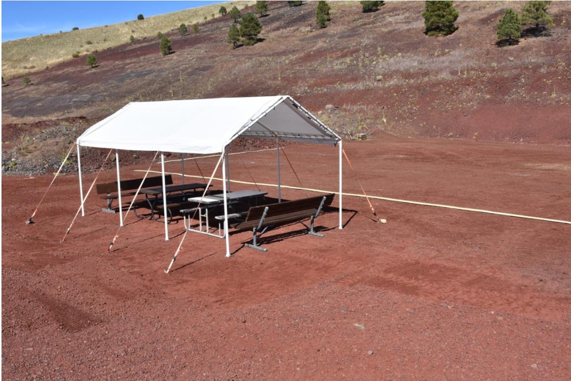
The now hand groomed, smooth surfaced, north center pistol bay. This bay is normally utilized by law enforcement agencies and the WSC has recently used it for our Practical Pistol shooting.