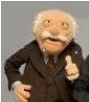
“Look at that rock solid stance!”