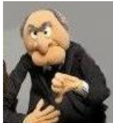
“He’s frozen solid you ding dong!”