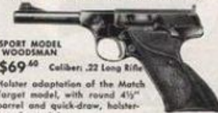
SPORT MODEL WOODSMAN $69. 40 Caliber: .22 Long Rifle

A revolver for 10-ring accuracy! Modified tapered barrel (6") for perfect balance. Fast cocking wide hammer spur, full checkered walnut stocks. Colt ACCRO Rear Sight, safety lock.