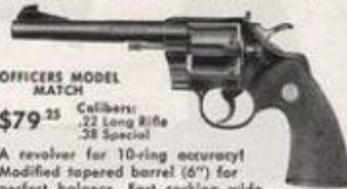
OFFICERS MODEL MATCH $79. 25 Caliber: .22 Long Rifle .28 Special

A heavy-barreled, precision automatic with perfect balance and sights permitting the finest adjustments. Barrel: 6" (optional, 4½"). Sights: Colt ACCRO Rear Sight, elevation and windage click adjustments. Custom type stocks with thumb rest, automatic slide stop, magazine safety.