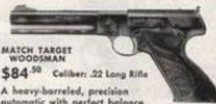
MATCH TARGET WOODSMAN $84. 50 Caliber: .22 Long Rifle

A heavy-barreled, precision automatic with perfect balance and sights permitting the finest adjustments. Barrel: 6" (optional, 4½"). Sights: Colt ACCRO Rear Sight, elevation and windage click adjustments. Custom type stocks with thumb rest, automatic slide stop, magazine safety.