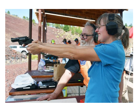
Mostly semi-automatic pistols with a few revolvers were used in calibers from .22 to 9mm

It should be noted that two of the ladies drove in from Winslow and two from Phoenix. When asked what made us so popular they stated that first time shooting opportunities specifically orientated for ladies are difficult to find.