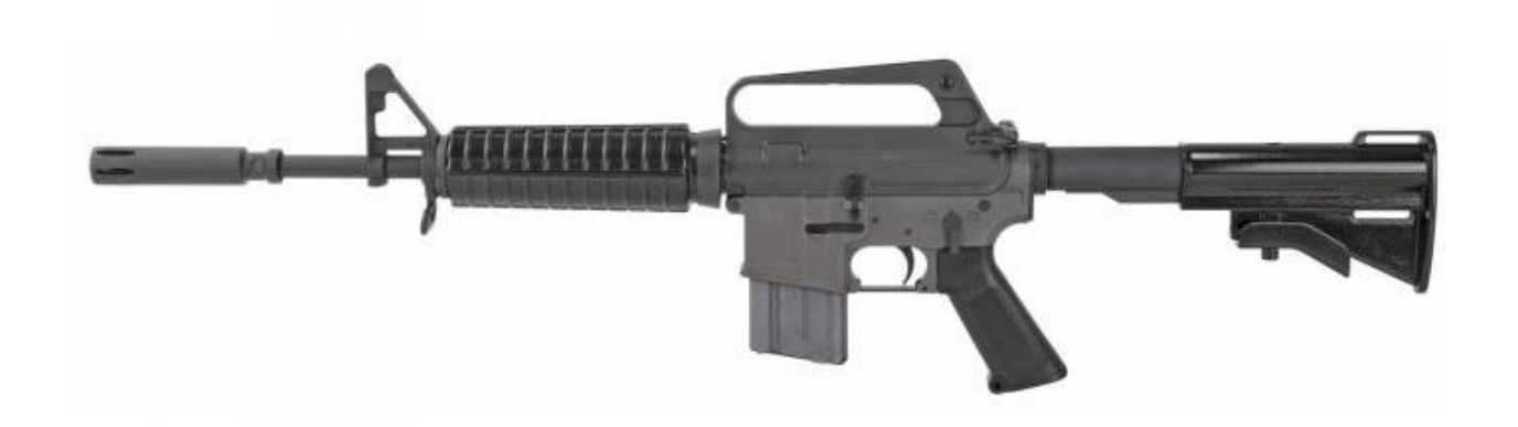
The XM177E2 Commando Returns!

Property Marked rollmarks. This is a true collectible that's as comfortable on the range as it will be in an enthusiast's display." Colt is making it available just like the original in almost every way except one – the MSRP is not the 1967 $147 price but a modernized $2499!