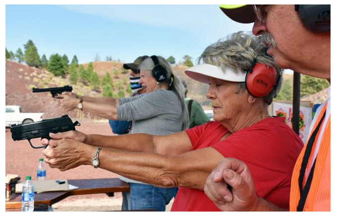
The ladies then begin sending rounds down range