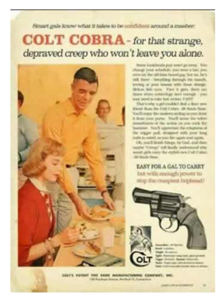
1963 Colt Cobra .38 Special "Creep Repellent" advertisement