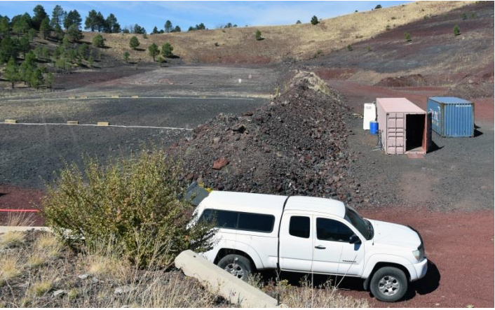
Crooked berm lines and "C" container in the way of realignment