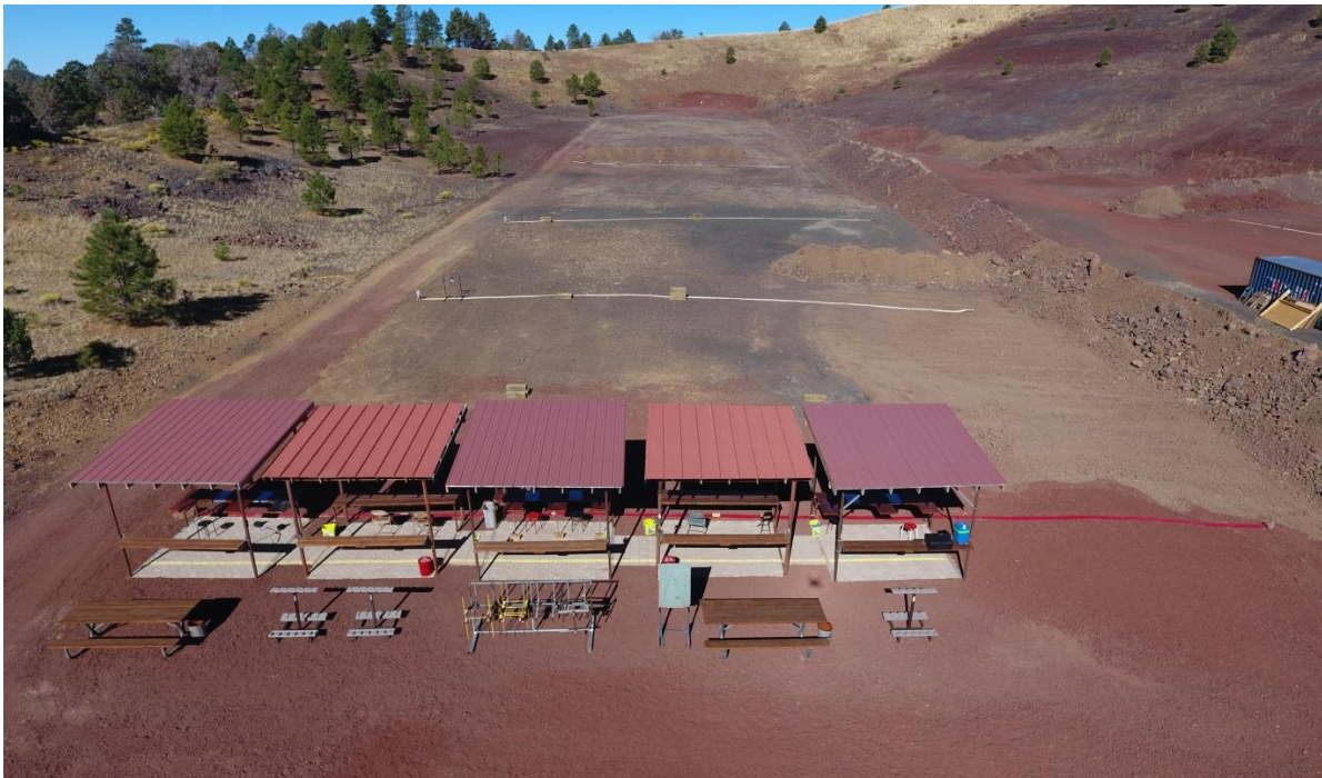
Close-up of Firing Ramadas and new 25 and 100 yard impact berms