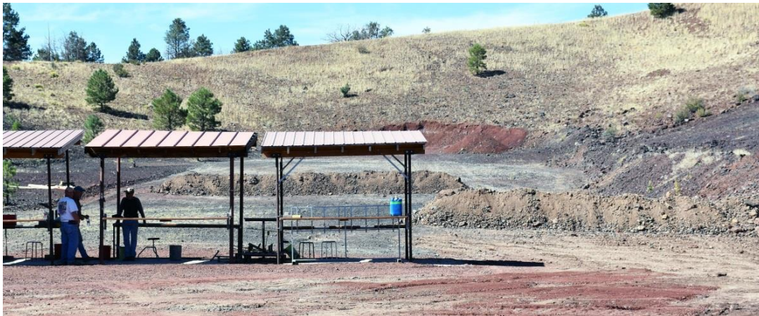
New 100 yard rifle and 25 yard pistol impact berms