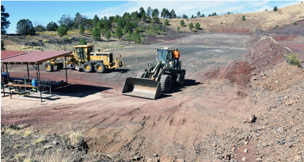
Berm straightened and extended to enhance safety