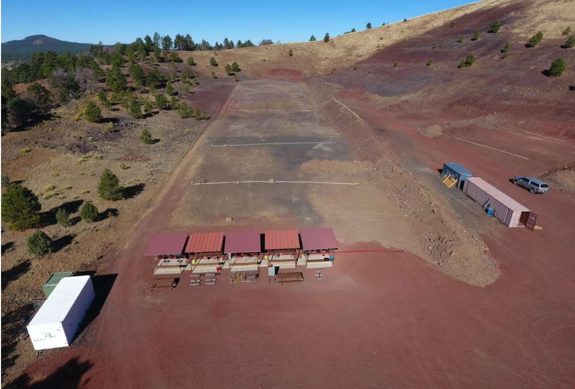
The finished product – Now THAT is a Shooting Range to be proud of!