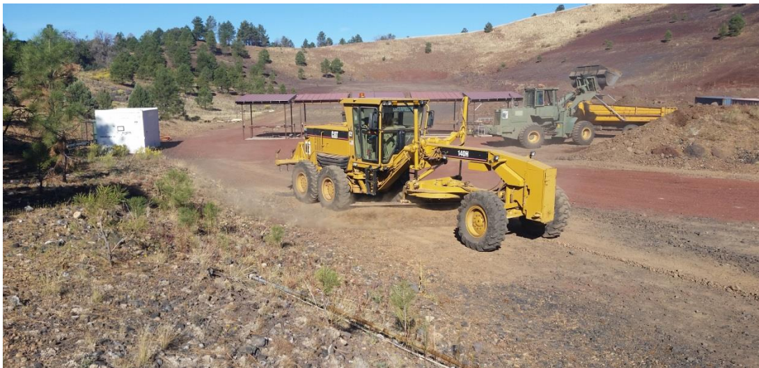
Grooming the parking area