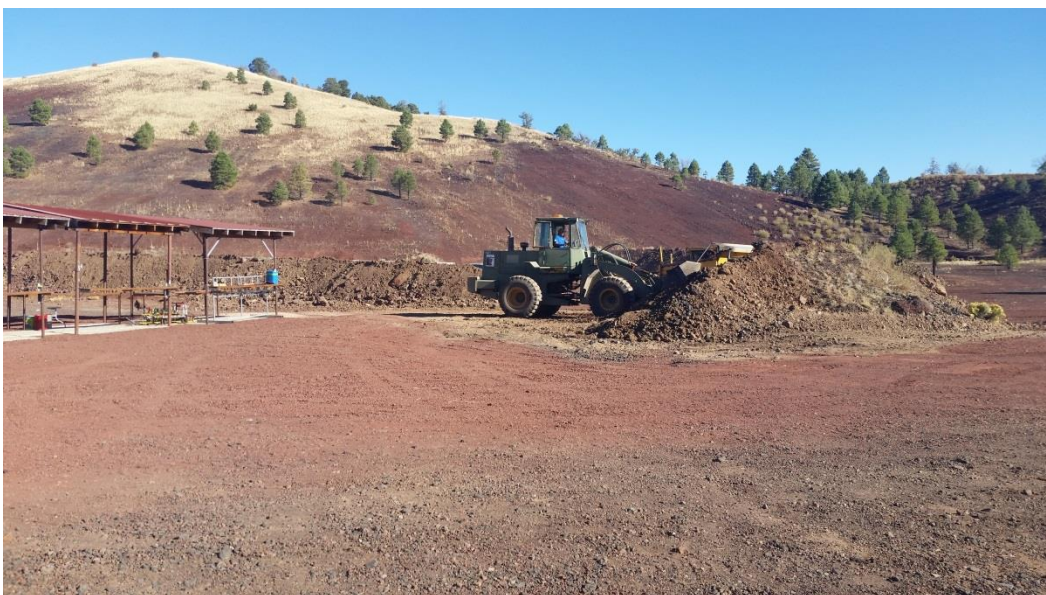
Mound behind firing ramadas that limited parking is going, going.....