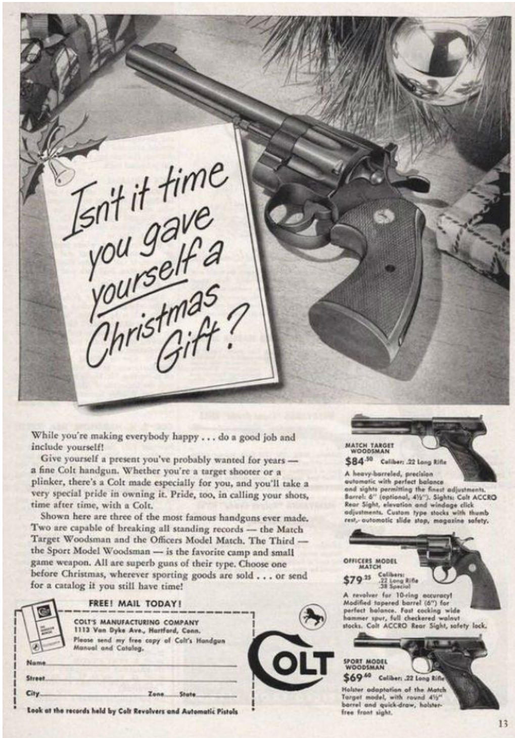
It's never too early to start your Christmas gift planning! (1969)

and making the WSC for our fellow shooting enthusiasts in the area a club worth joining. Let your shotgun toting, clay pigeon busting friends know. PULL!