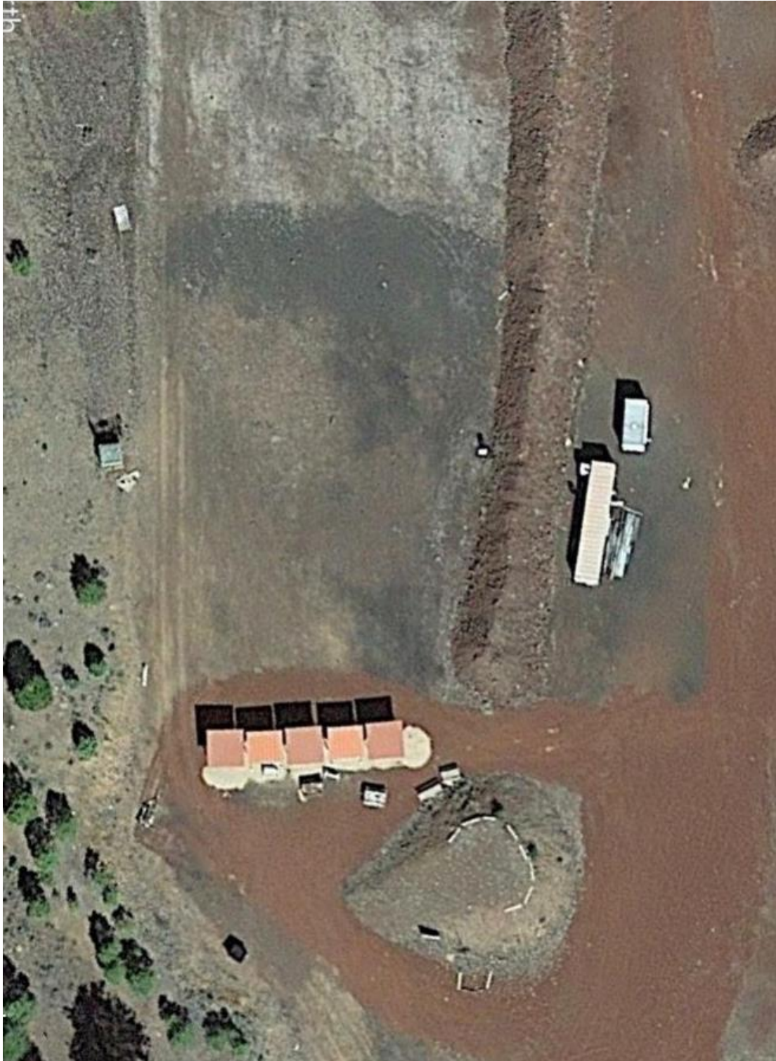
Before - Notice the crooked berm as it slowly turned inward toward the ramadas and the resulting loss of 1/3 of the useable down range firing area, the unusable and obstructive mound that consumes most of the available parking area, and the need to re-position the WSC conex box to accommodate berm re-alignment.