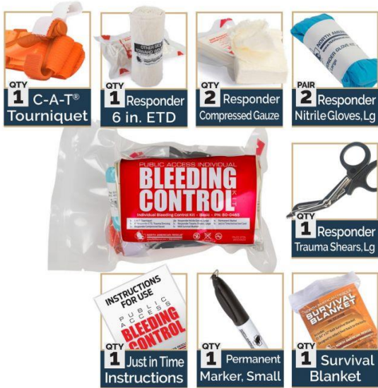
Contents of Basic Individual Bleeding Control Kit

Annette Perkins advises that the NAR Individual Bleeding Control Kit is available to WSC members to help save lives. It provides lifesaving bleeding control equipment such as tourniquets, pressure dressings, shears, and gauze bandages. It retails for $53 and is available from North American Rescue.